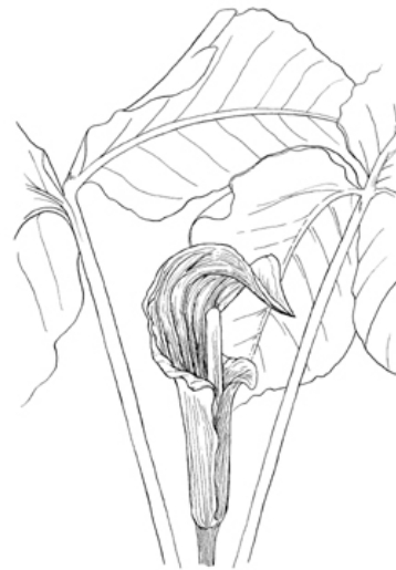
Jack-in-the-pulpit ( Arisaema triphyllum )

For People Who Like Learning About West Virginia's Native Plants and Their Habitats.