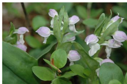
Showy Orchis ( Galearis spectabilis )

Please contact Steve Mace about forming new chapters at sdmace@frontiernet.net .