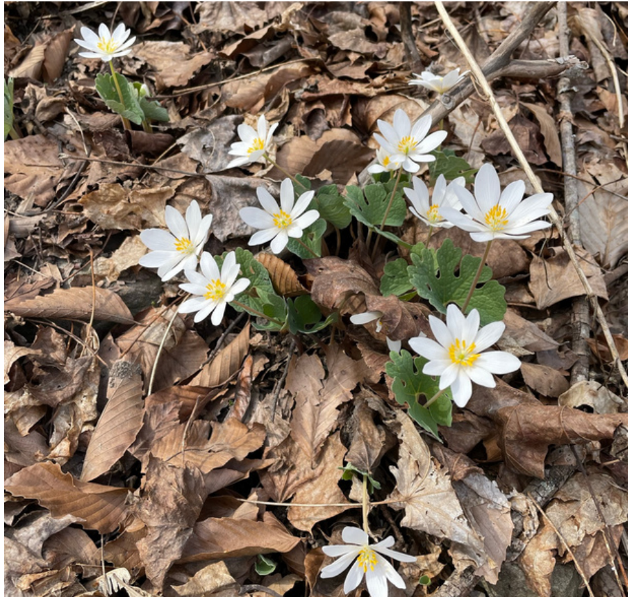
Bloodroot ( Sanguinaria canadensis )

Our Facebook page continues to grow and grow! We now have over 23,000 followers. It's a great place to learn about native plants and see what is blooming in your region. Many thanks to our dedicated Admins and Moderators for keeping things under control. facebook.com/groups/wvnps