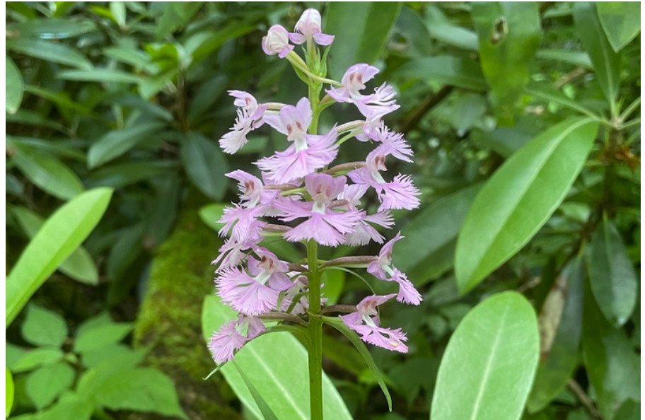
Large Purple Fringed Orchid ( Plantanthera grandiflora )

He was a regular attendee to the WVNPS outings, in his multi colored truck with his faithful canine companion Pokey. He will be missed by all. ❁