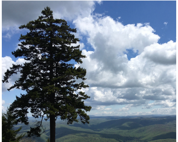
The view from Gaudineer Scenic Area.

Most of the nearest overnight accommodations are in Elkins, WV. The two closest motels are Valley View Motel in Mill Creek, WV, and the Boyer Motel in Arbovale, WV. Primitive camping in the Monongahela National Forest is available in the area. ❁