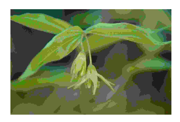
Prosartes lanuginosa Hairy Disporum

Goodyera pubescens Downy Rattlesnake Plantain