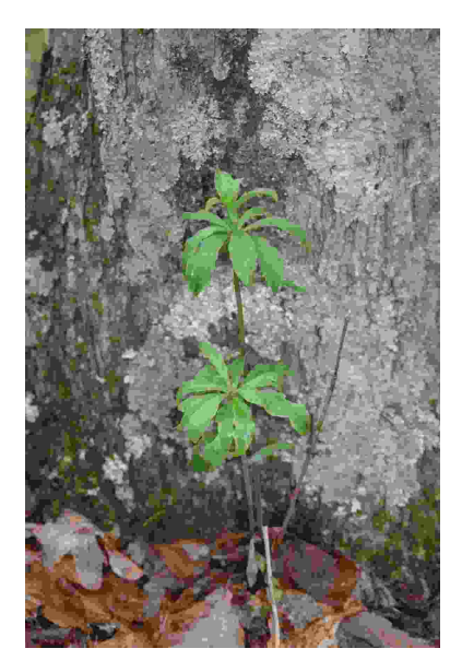
Isotria verticillata Whorled Pogonia