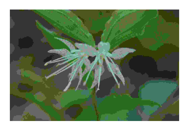
Prosartes maculata Mandarin