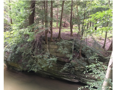
Canyon trail view

The West Virginia Native Plant Society will conduct a field trip to Tomlinson Run State Park, in conjunction with an old growth forest survey led by Doug Wood during the weekend of June 24-25, 2022. The area consists of second growth hardwood forest as well as wetland areas. An interesting steep canyon winds through a portion of the park. A number of species of plants normally found at higher elevations in the state have been noted in the park. We will search again for Canada Yew (it's mentioned in their park brochure)