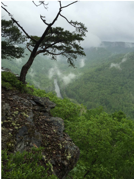
View from Elk Mountain

Venus' Looking Glass Coltsfoot Bloodroot Wild Ginger River Birch Wild Stonecrop Common Mugwort Lesser Stitchwort Sandbar Willow Whiplash Dewberry Carolina Cranesbill Wild Geranium Sweet Flag Eastern Poison Ivy Stinging Nettle Sourwood Field Pussytoes Yellow Stargrass Witch-Hazel Common Greenbrier Hispid Greenbrier Foamflower Intermediate Enchanter's-Nightshade Buffalonut Indian Cucumber Root Whorled Pogonia Glade Fern Maidenhair Fern Rattlesnake Fern Silvery Athyrium Northeastern Lady Fern Ramp Black Cohosh Blue Cohosh Alternate-Leaved Dogwood Flowering Dogwood Heal-All