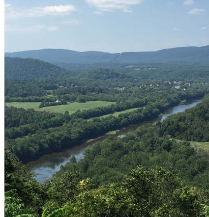
Looking toward Eidolon