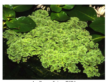
Azolla caroliniana Willd Carolina mosquito fern creative commons photo

The WV Atlas lists 77 species and hybrids found in 14 genera including: