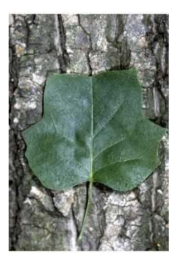
Robert H. Mohlenbrock, hosted by the USDA-NRCS PLANTS Database / USDA NRCS. 1995. Northeast wetland flora: Field office

Flowers have three sepals and six to many petals. Stamens and pistils are arranged in spirals on a conical Liriodendron tulipifera receptacle.