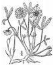
TRIFOLIUM VIRGINICUM Kate's Mountain Clover