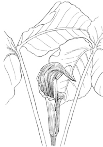
Jack-in-the-pulpit ( Arisaema triphyllum )

For People Who Like Learning About West Virginia's Native Plants and Their Habitats.