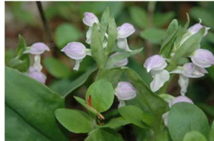
Showy Orchis ( Galearis spectabilis )

Please contact Steve Mace about forming new chapters at sdmace@frontiernet.net .