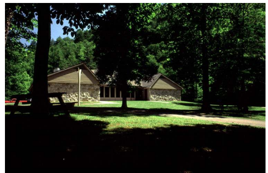
Group Meeting Lodge

Group lodging is available for Friday and Saturday nights, one night for $15 and both for $30. At this facility it is bring your own linens and expect to use a communal kitchen.